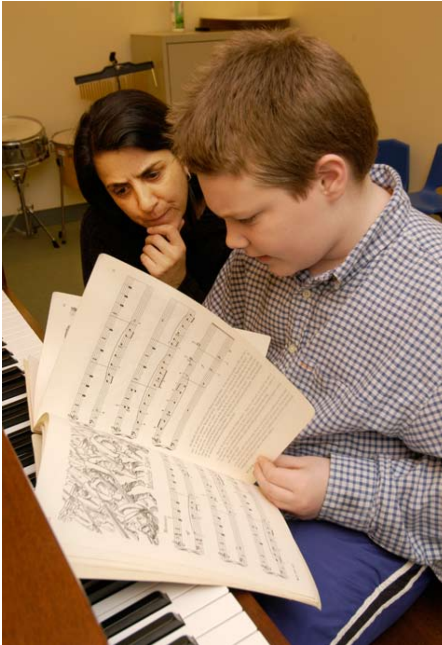
This boy with autism finds comfort in the structure of classical music.