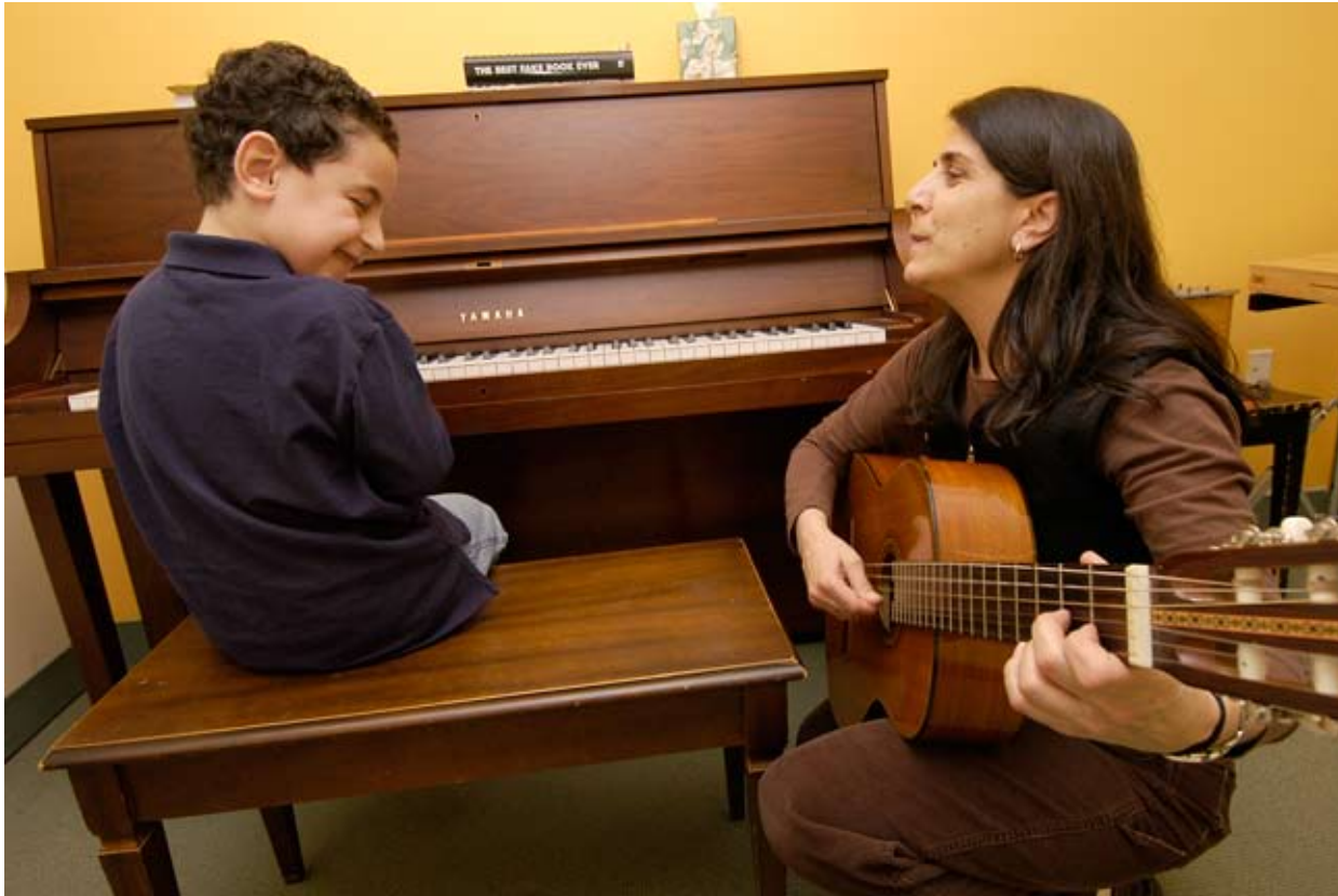
Lisa must continually assess each clients emotional response as the session proceeds. This is done not only from session to session, but from moment to moment.