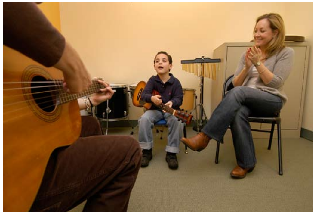
Lisa will often include parents into a music therapy session.