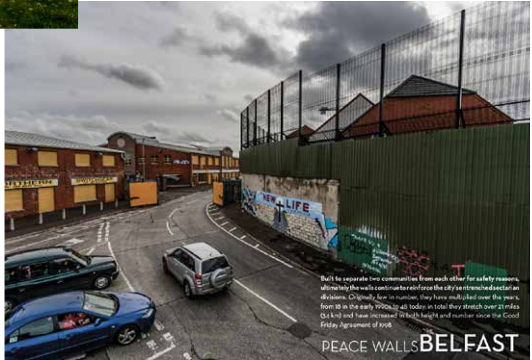
Built to separate two communities from each other for safety reasons, ultimately the wall continues to reinforce the city's entrenched sectarian divisions. Originally low in number, they have multiplied over the years, from 10 in the early 1990s to 45 today, in total they stretch over 21 miles (34 kms) and have increased in both height and number since the Good Friday Agreement of 1998.