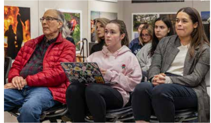
Many in the audience said they found the presentation insightful and inspiring.