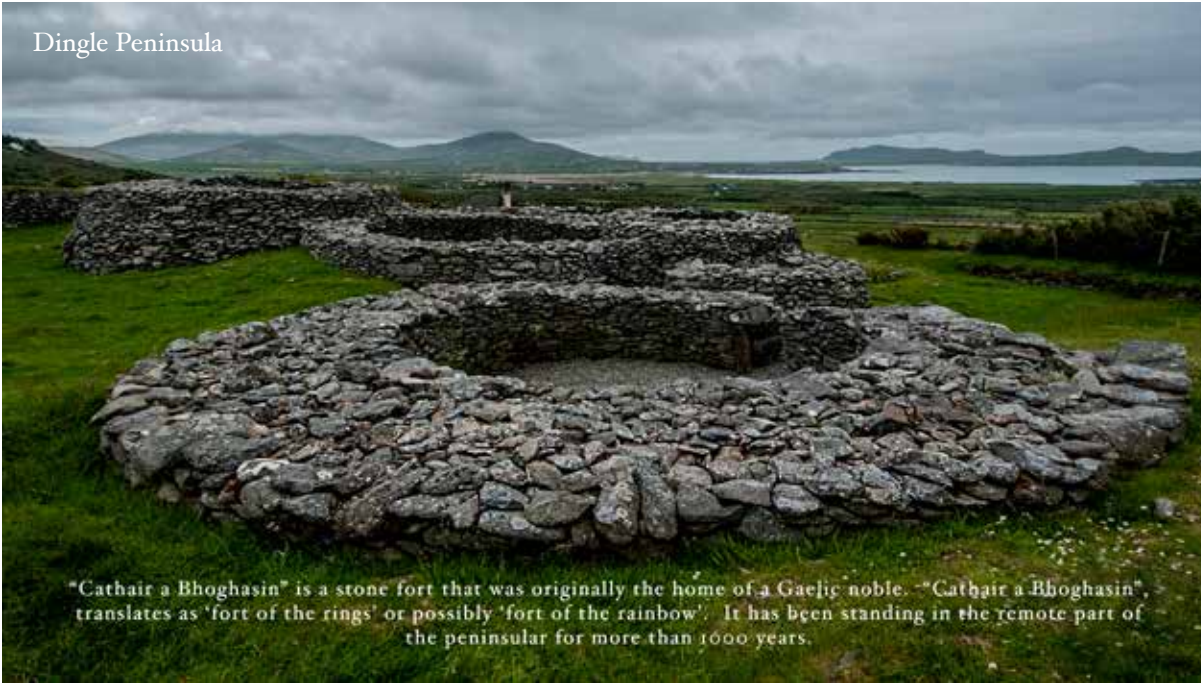
"Cathair a Bhoghasin" is a stone fort that was originally the home of a Gaelic noble. "Cathair a Bhoghasin" translates as 'fort of the rings' or possibly 'fort of the rainbow'. It has been standing in the remote part of the peninsular for more than 1000 years.