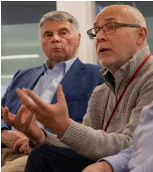
Members in the audience participated in the discussion.